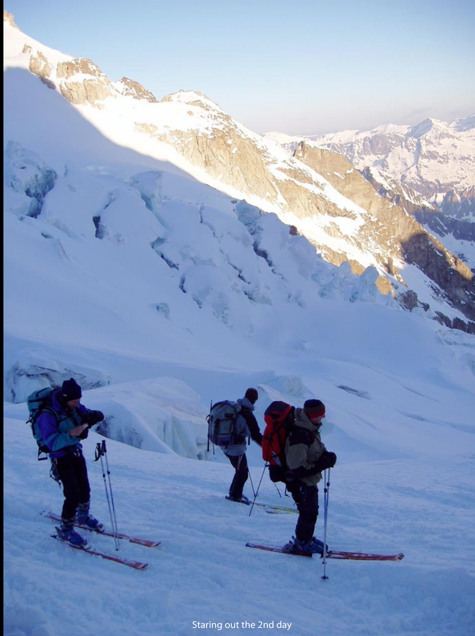
Staring out the 2nd day