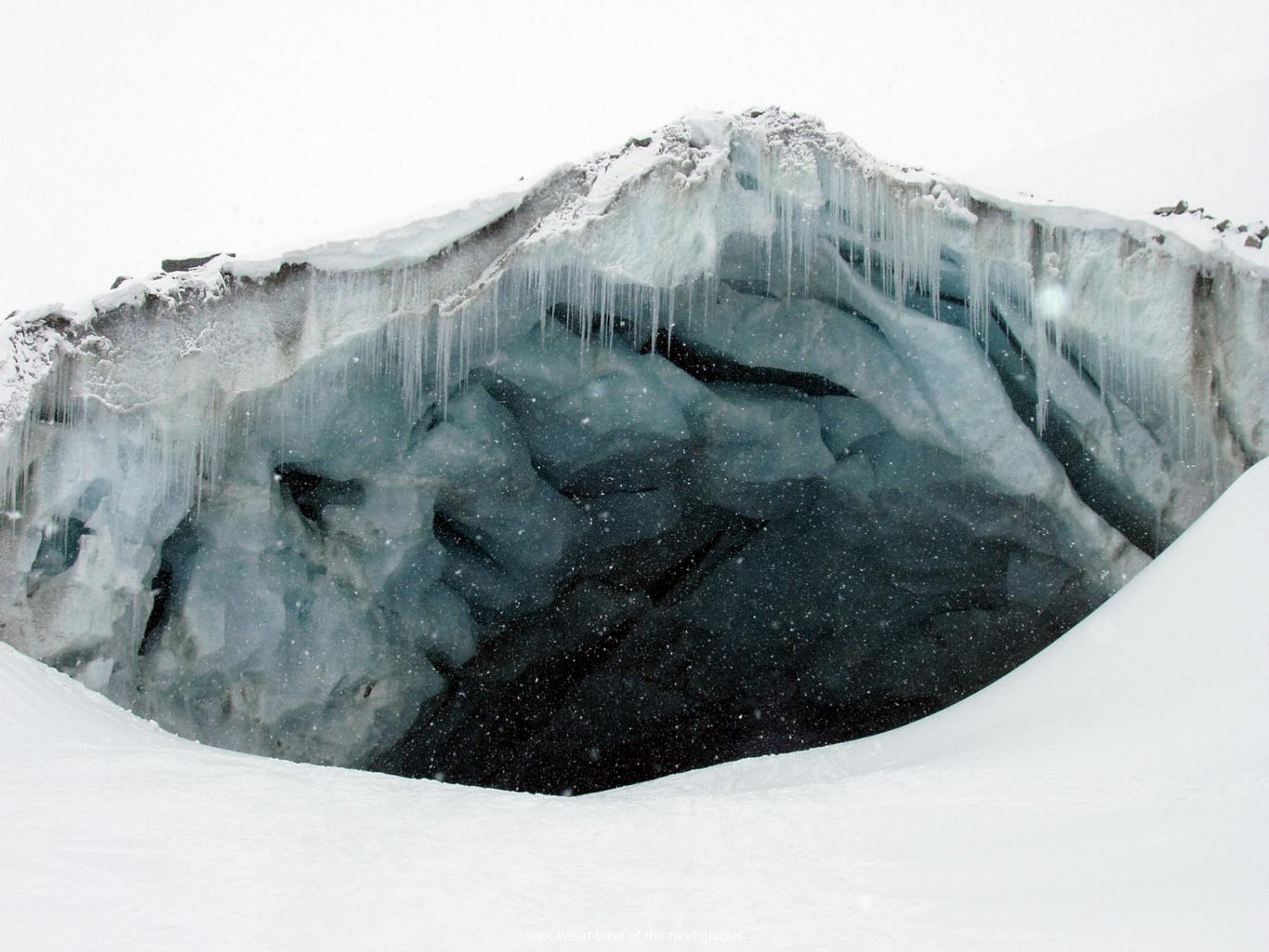
Ice cave at base of the next glacier