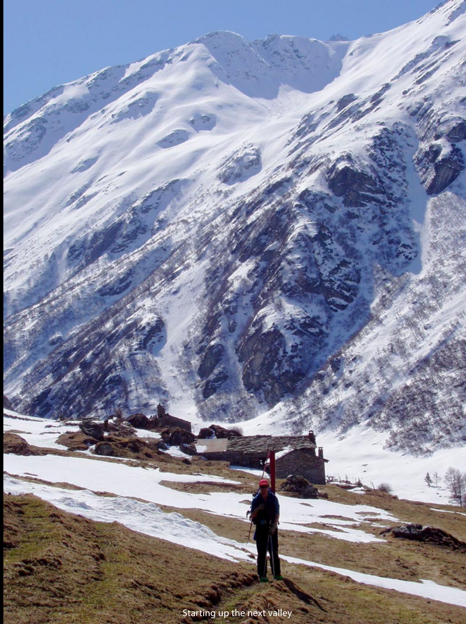
Starting up the next valley