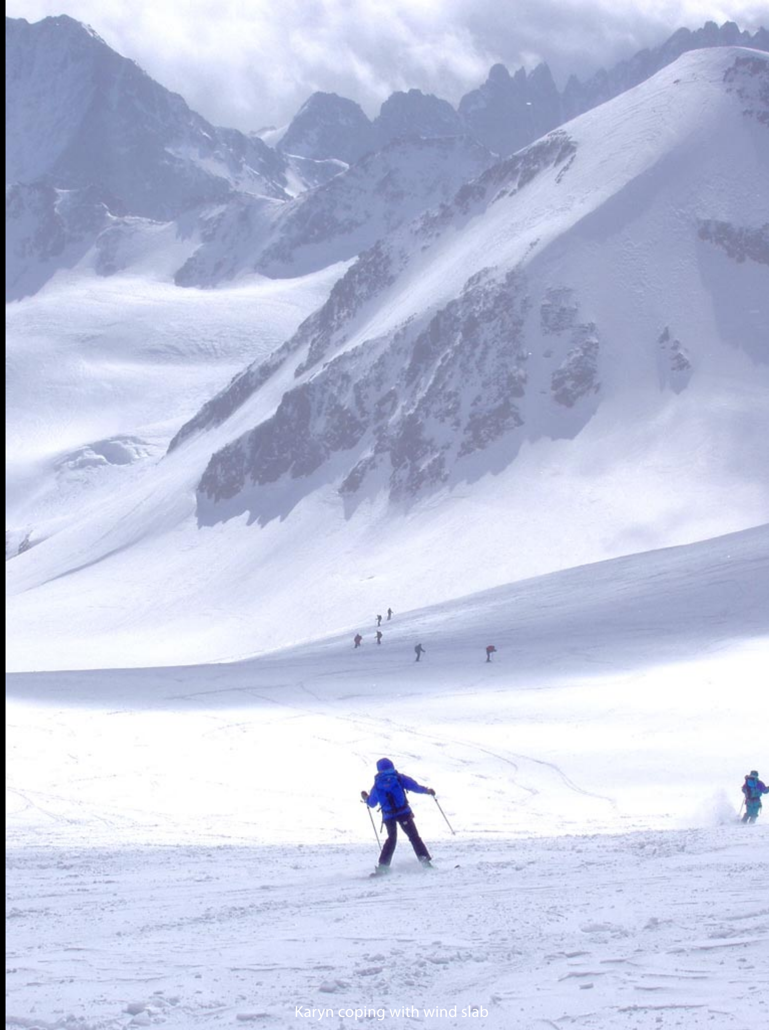
Karyn coping with wind slab