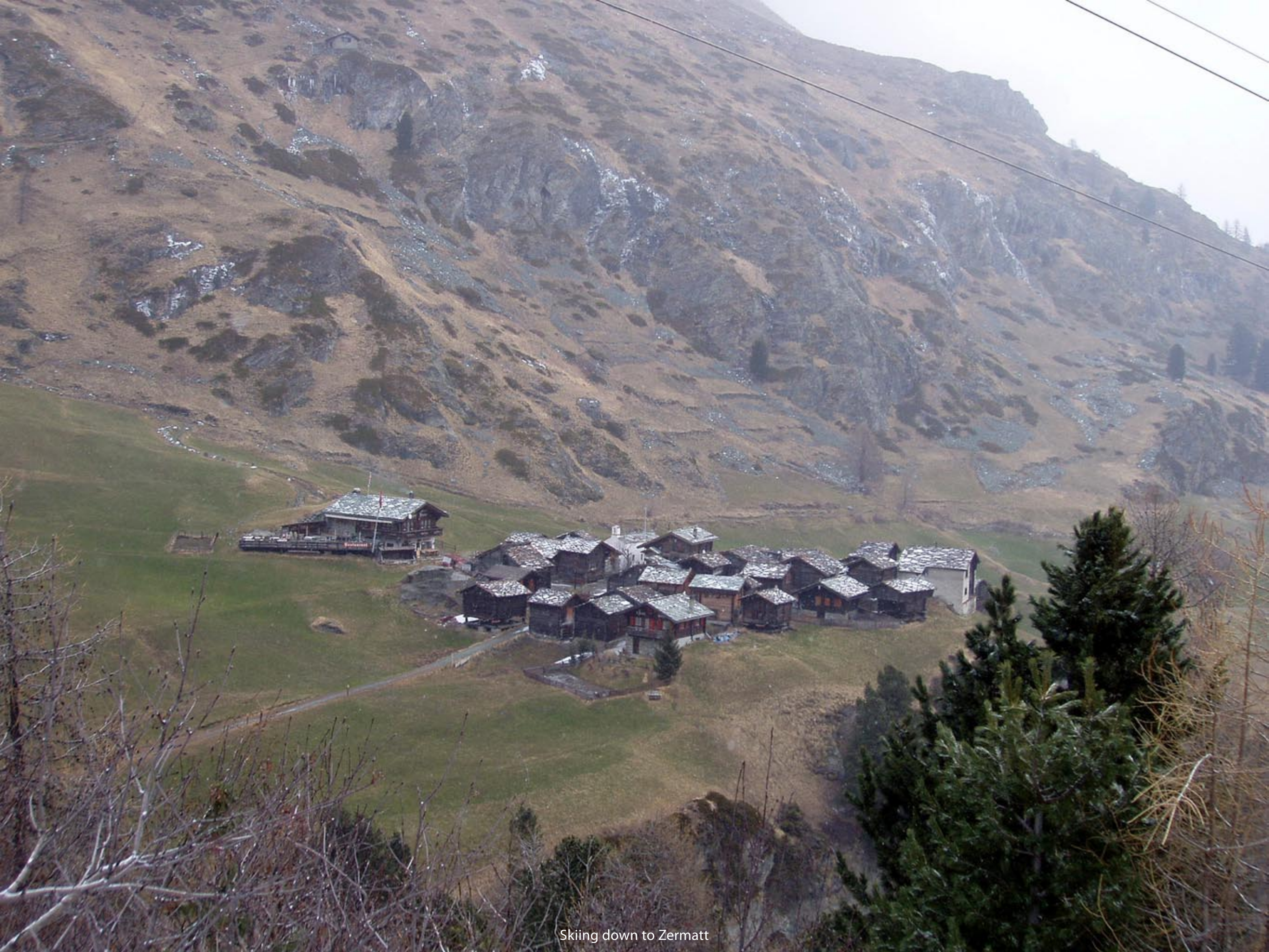
Skiing down to Zermatt