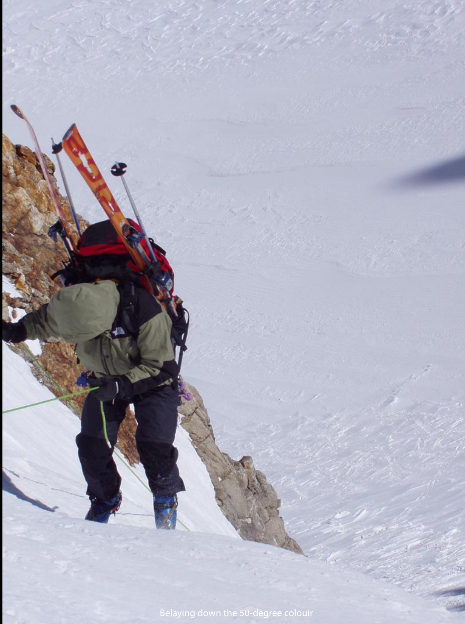
Belaying down the 50-degree colourir