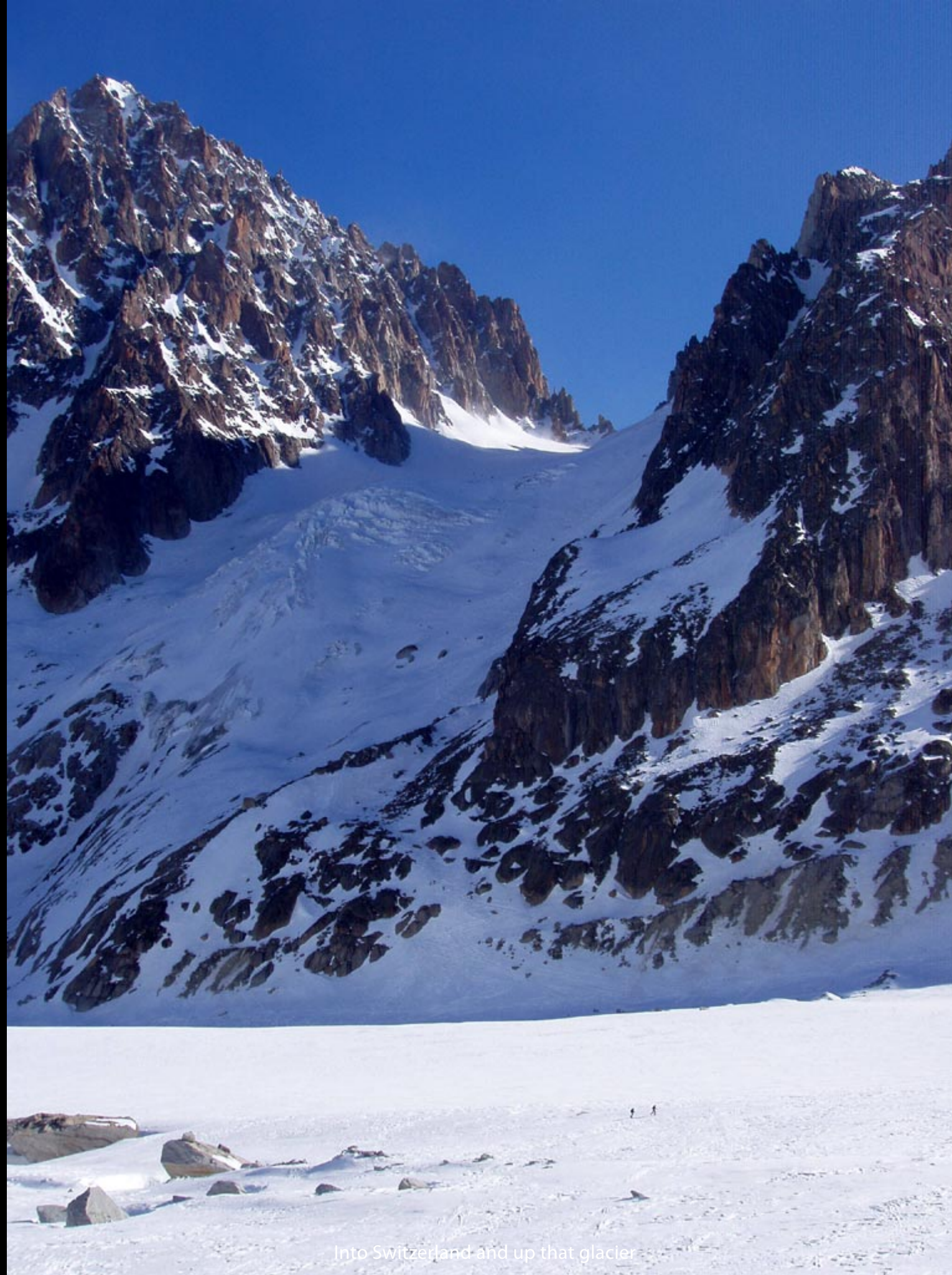
Into Switzerland and up that glacier