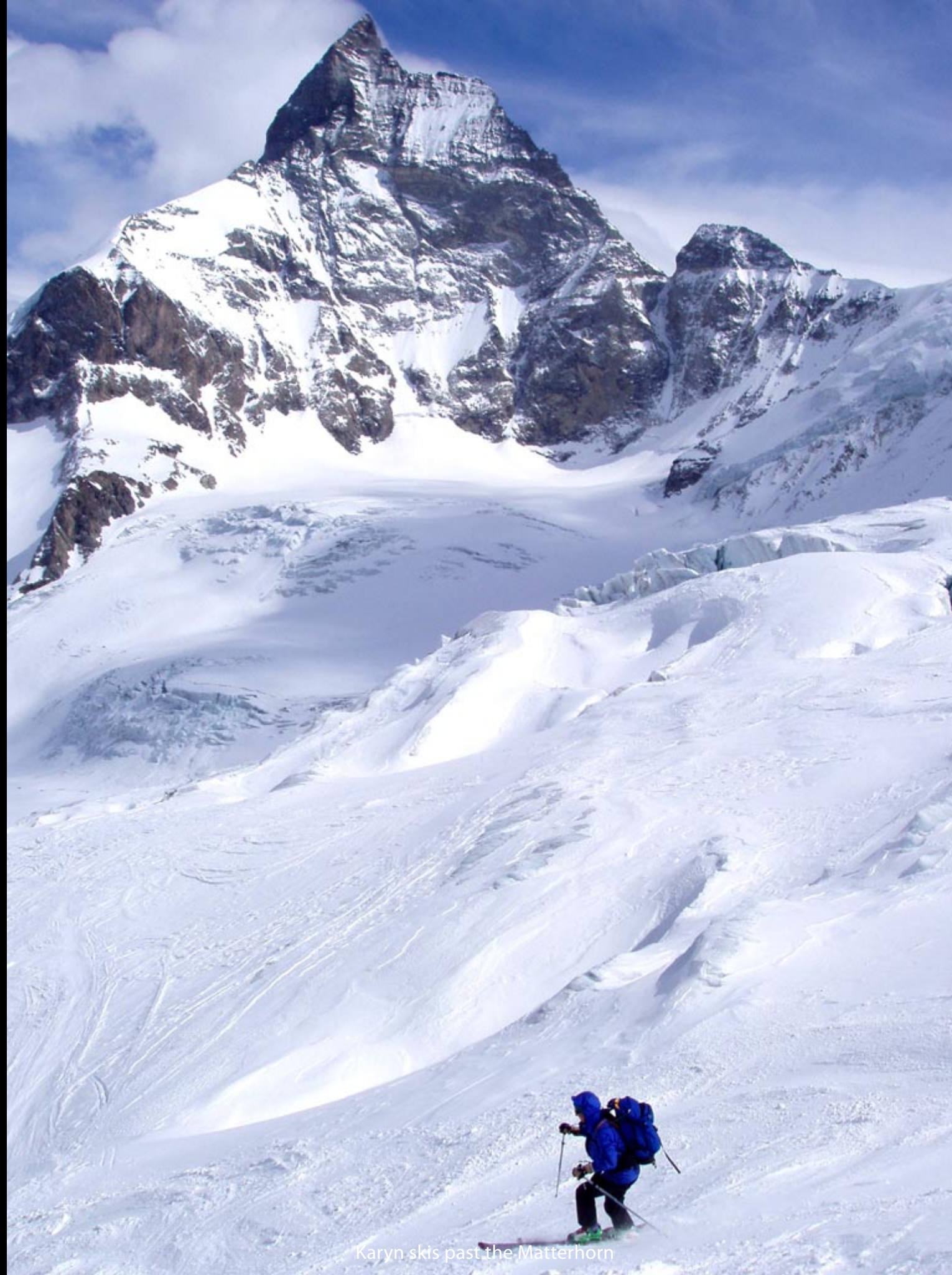
Karyn skis past the Matterhorn