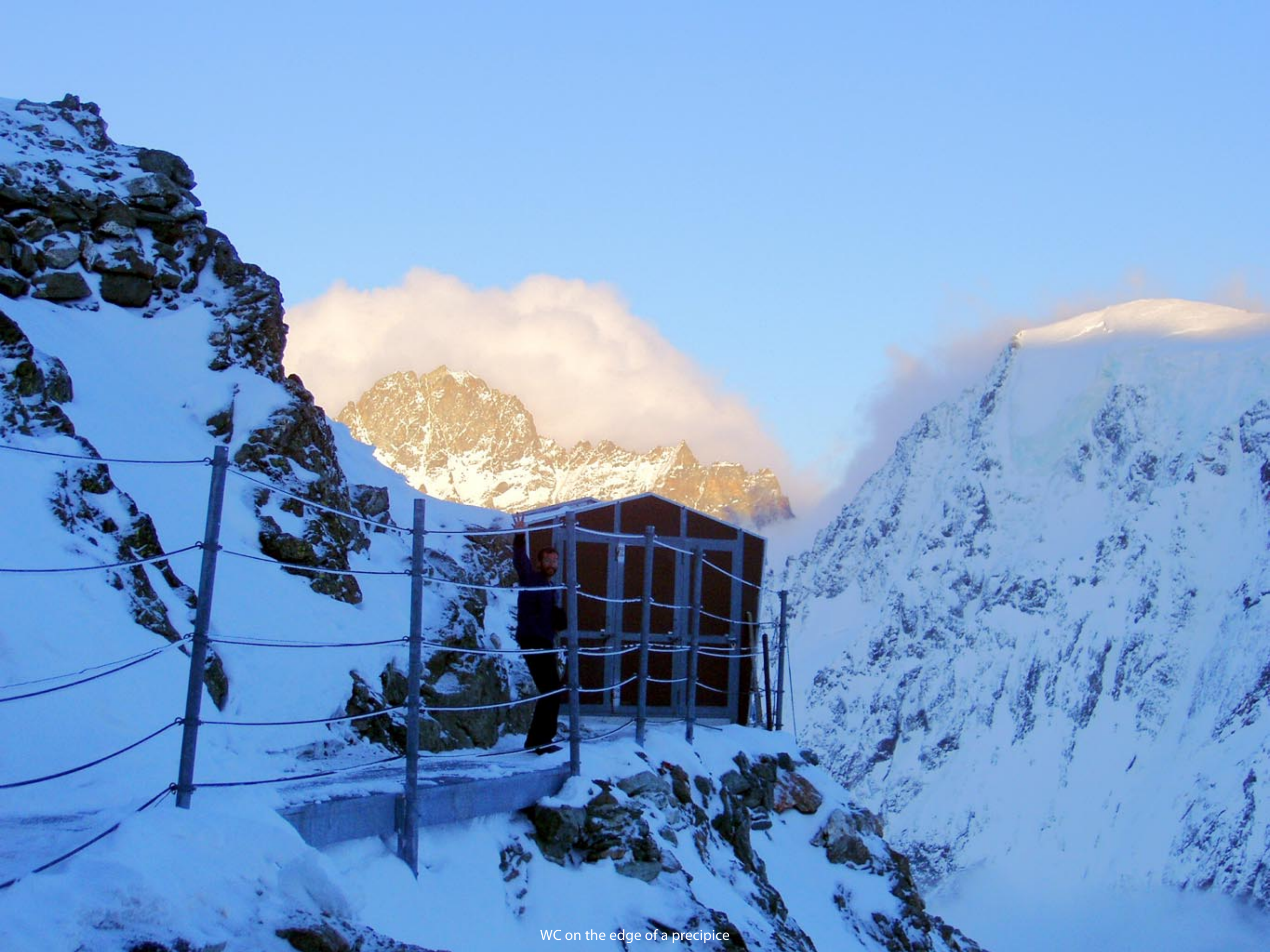
WC on the edge of a precipice