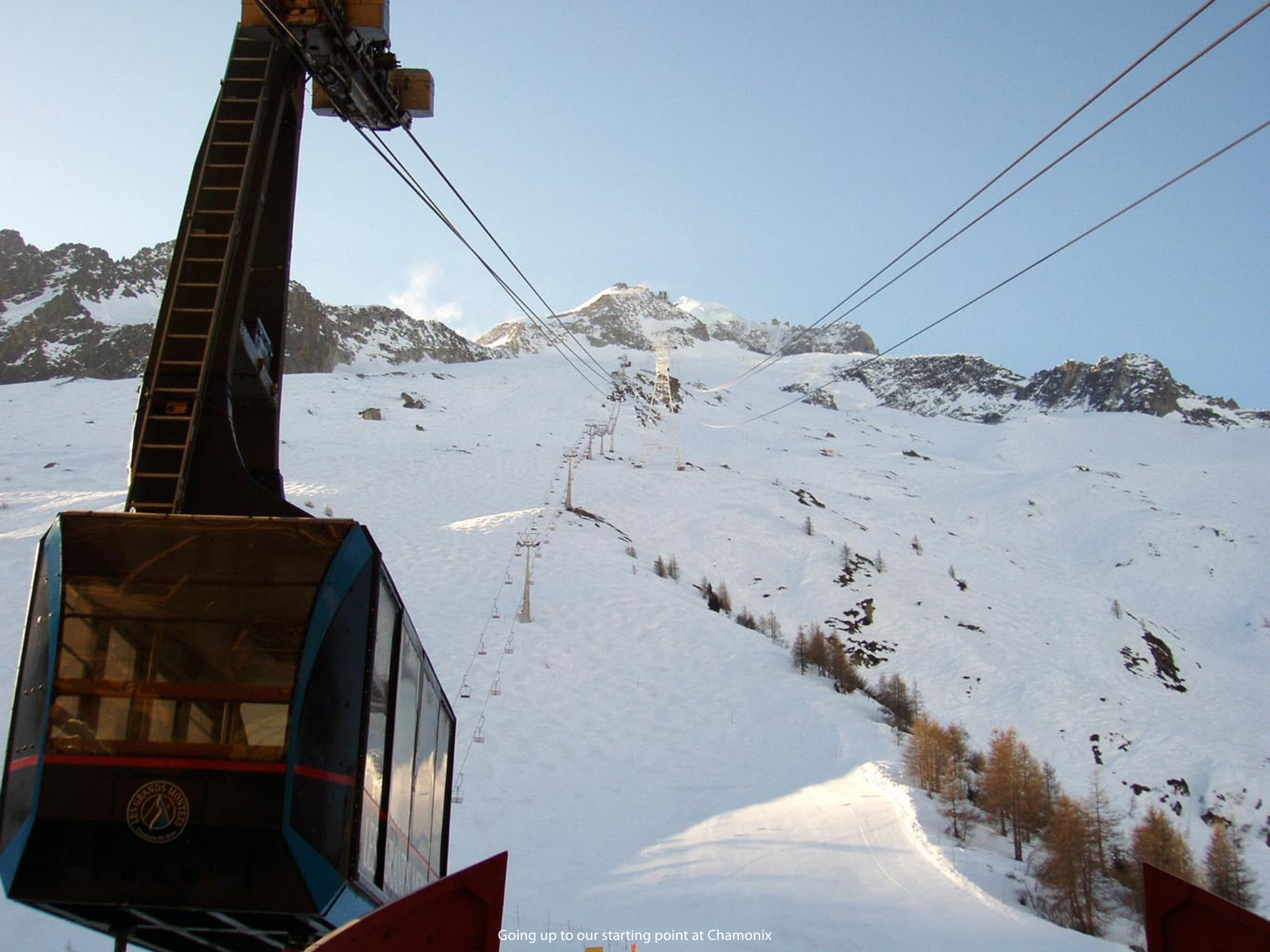
Going up to our starting point at Chamonix