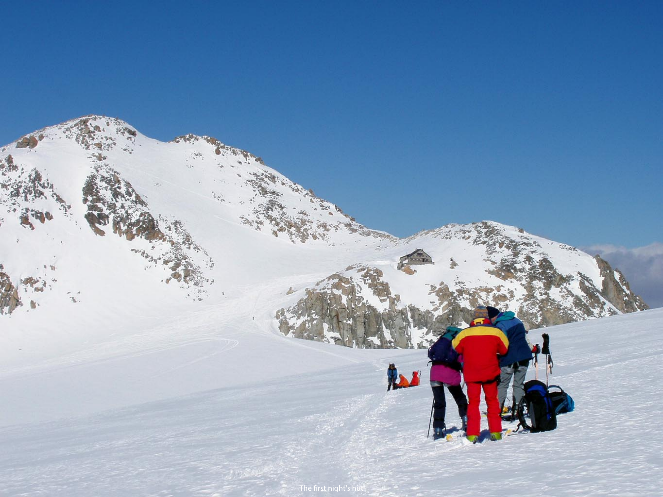
The first night's hut