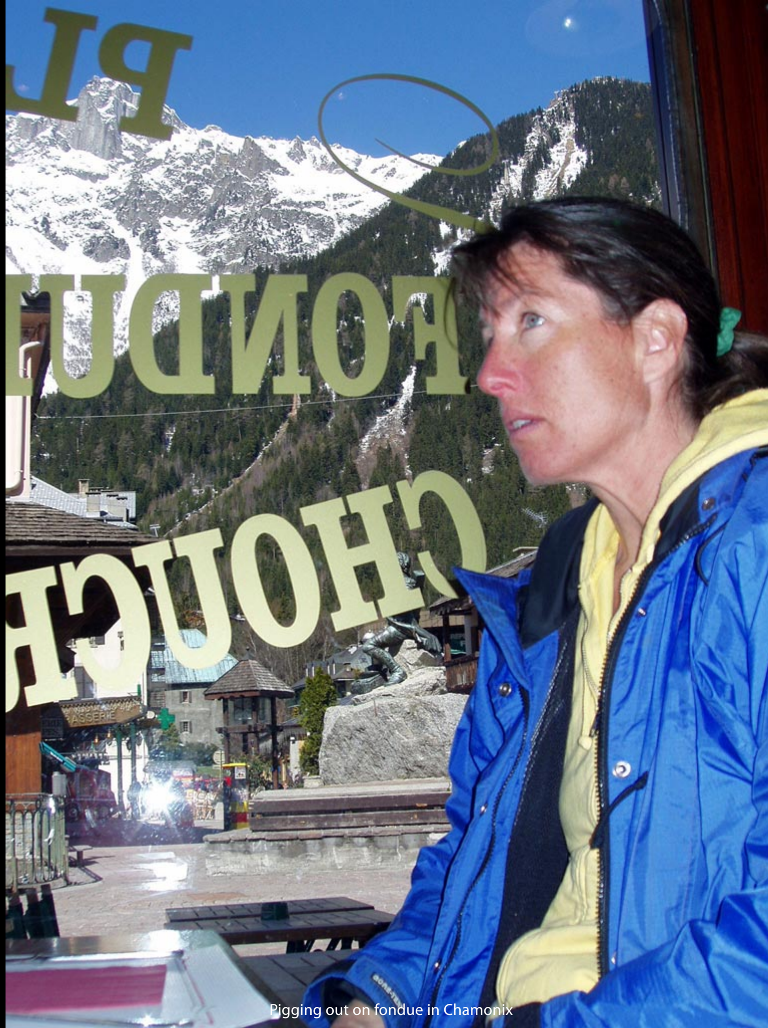
Pigging out on fondue in Chamonix