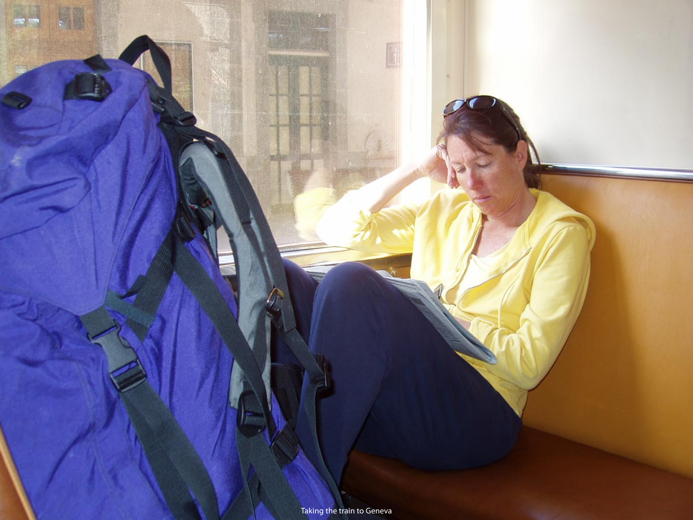
Taking the train to Geneva