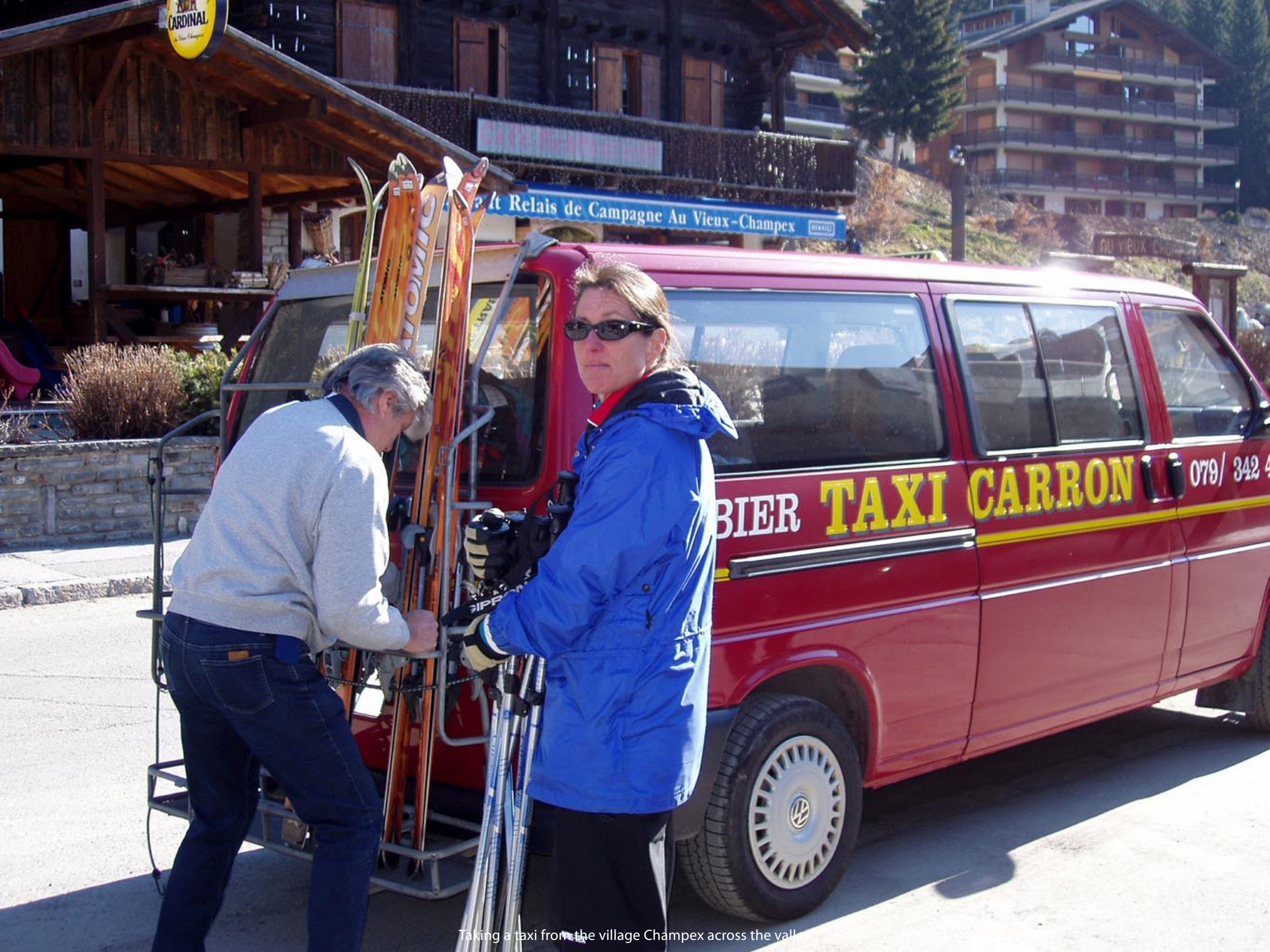
Taking a taxi from the village Champex across the valley