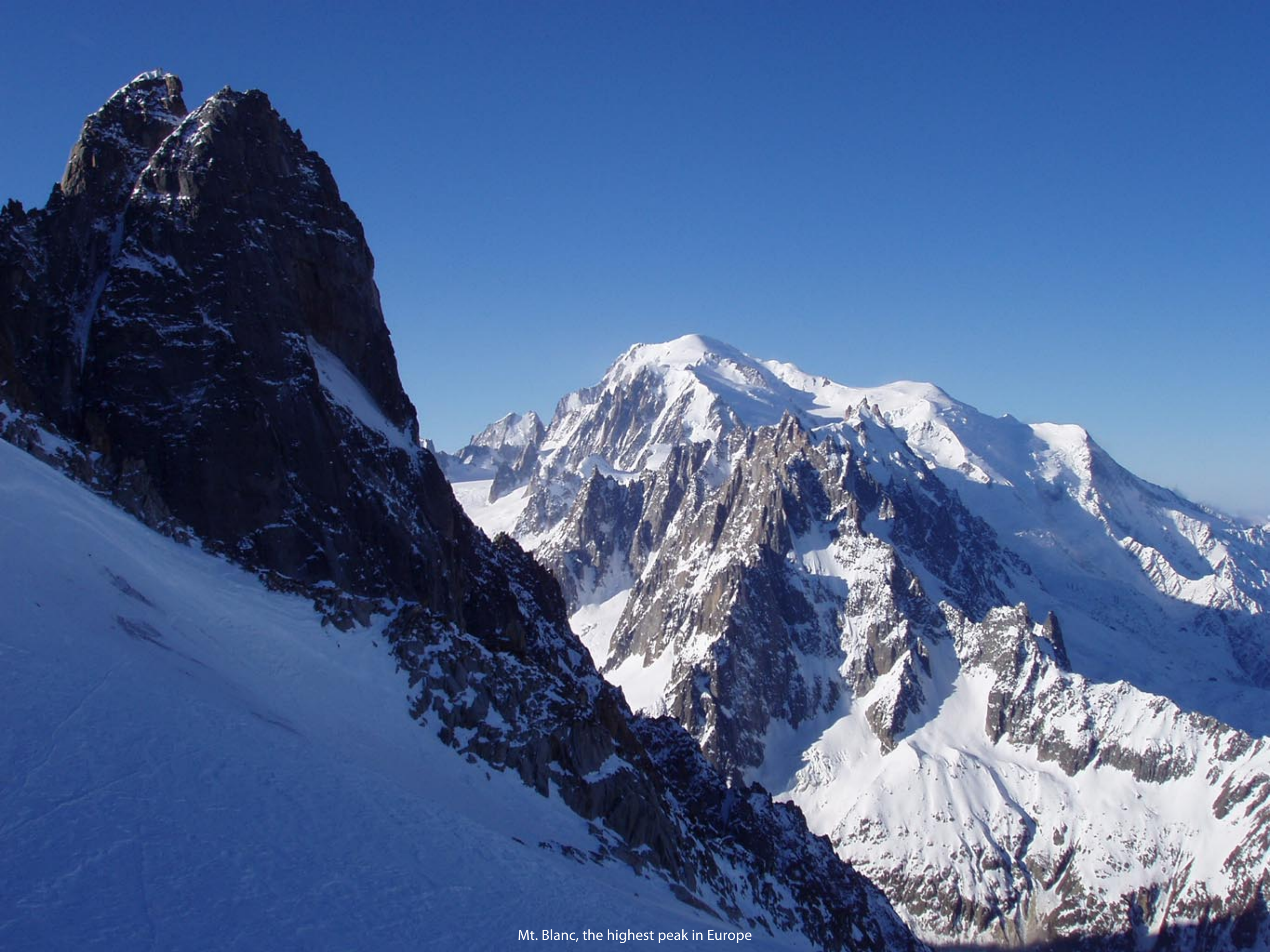
Mt. Blanc, the highest peak in Europe