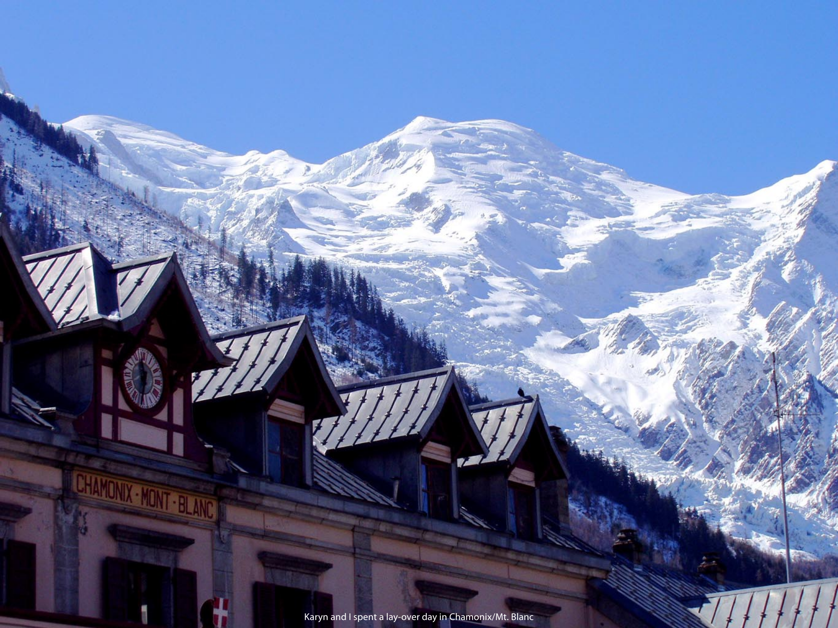
Karyn and I spent a lay-over day in Chamonix/Mt. Blanc