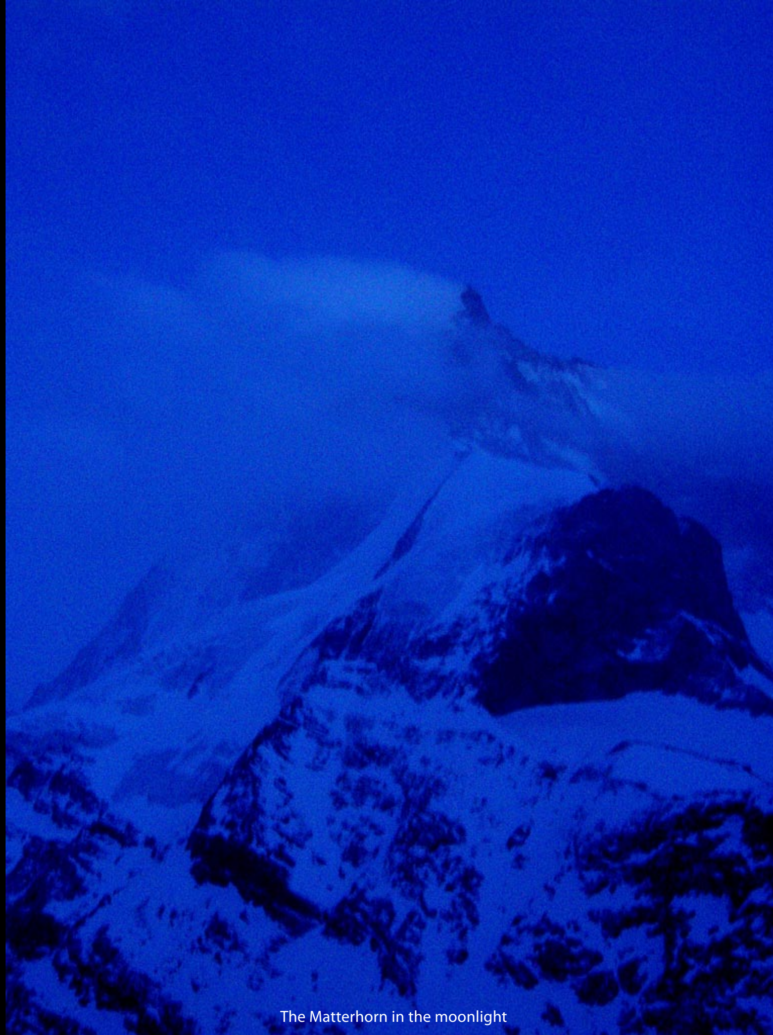
The Matterhorn in the moonlight