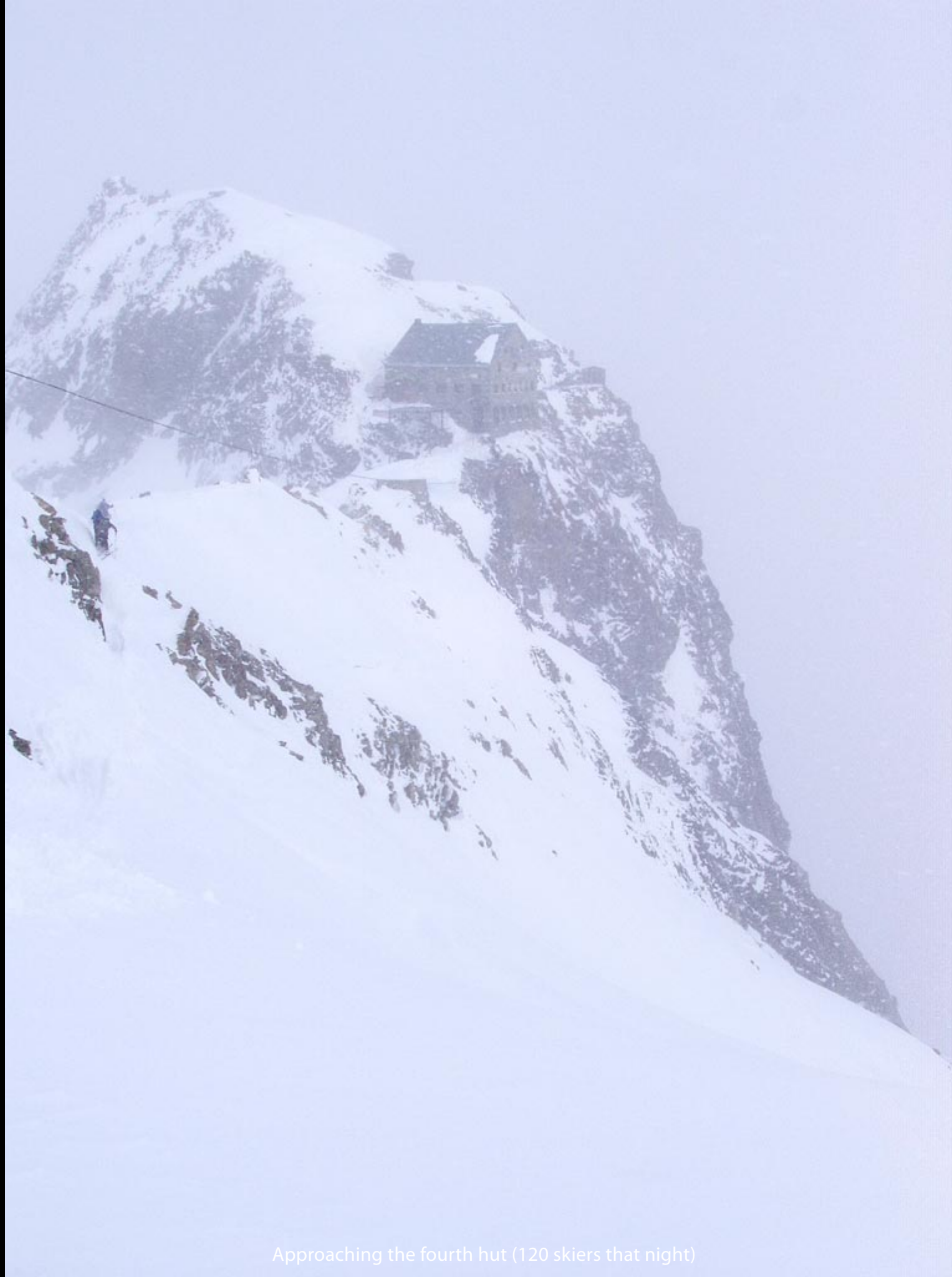
Approaching the fourth hut (120 skiers that night)