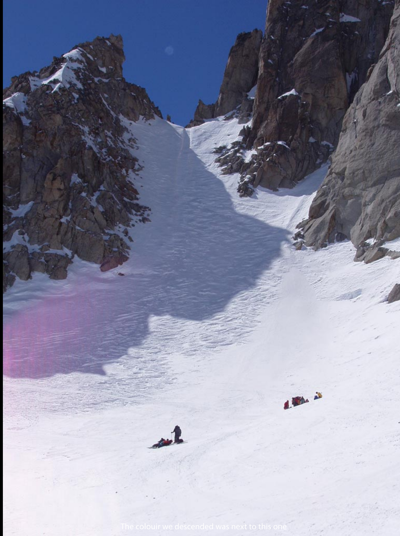
The colour we descended was next to this one