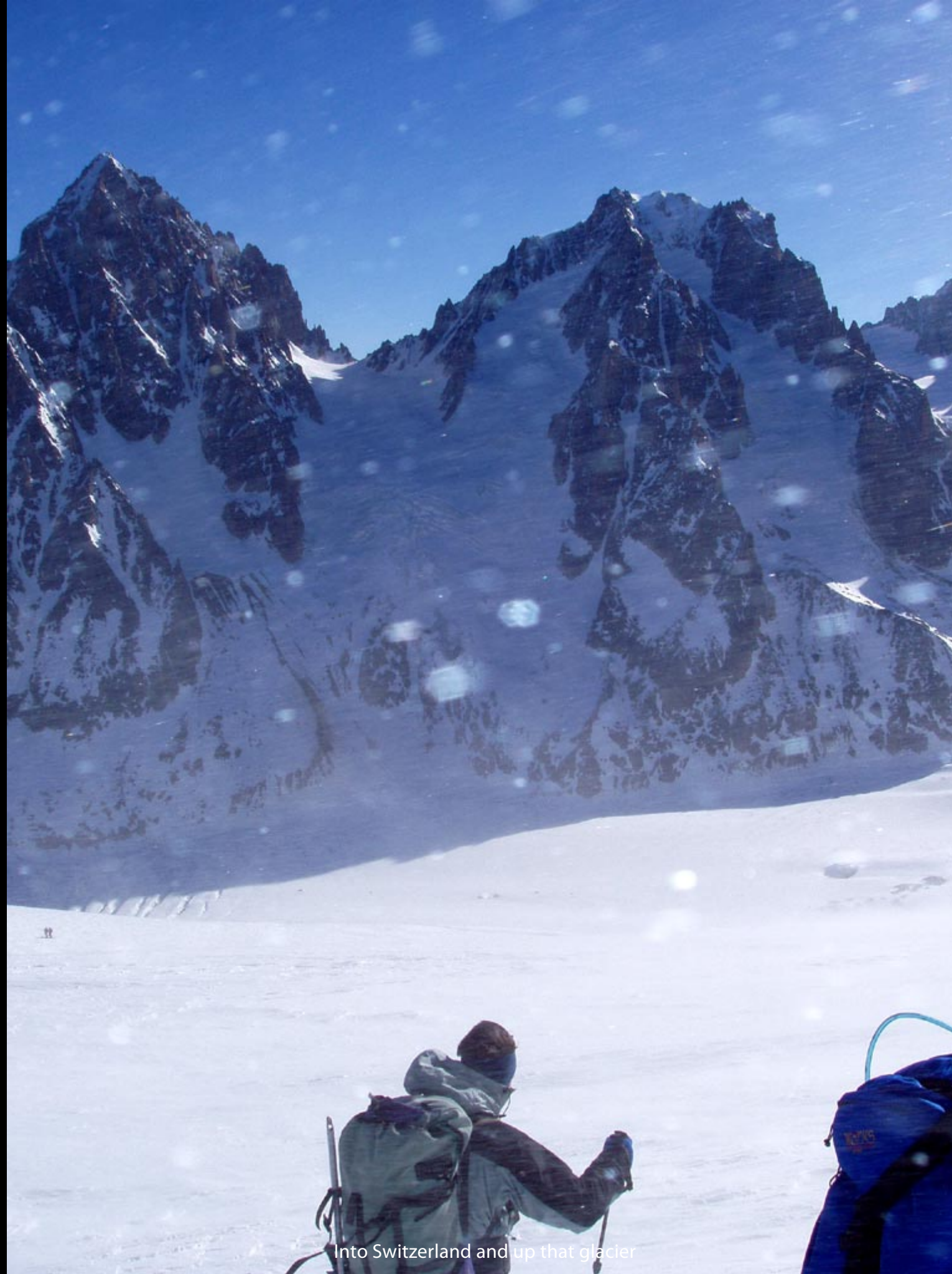
Into Switzerland and up that glacier