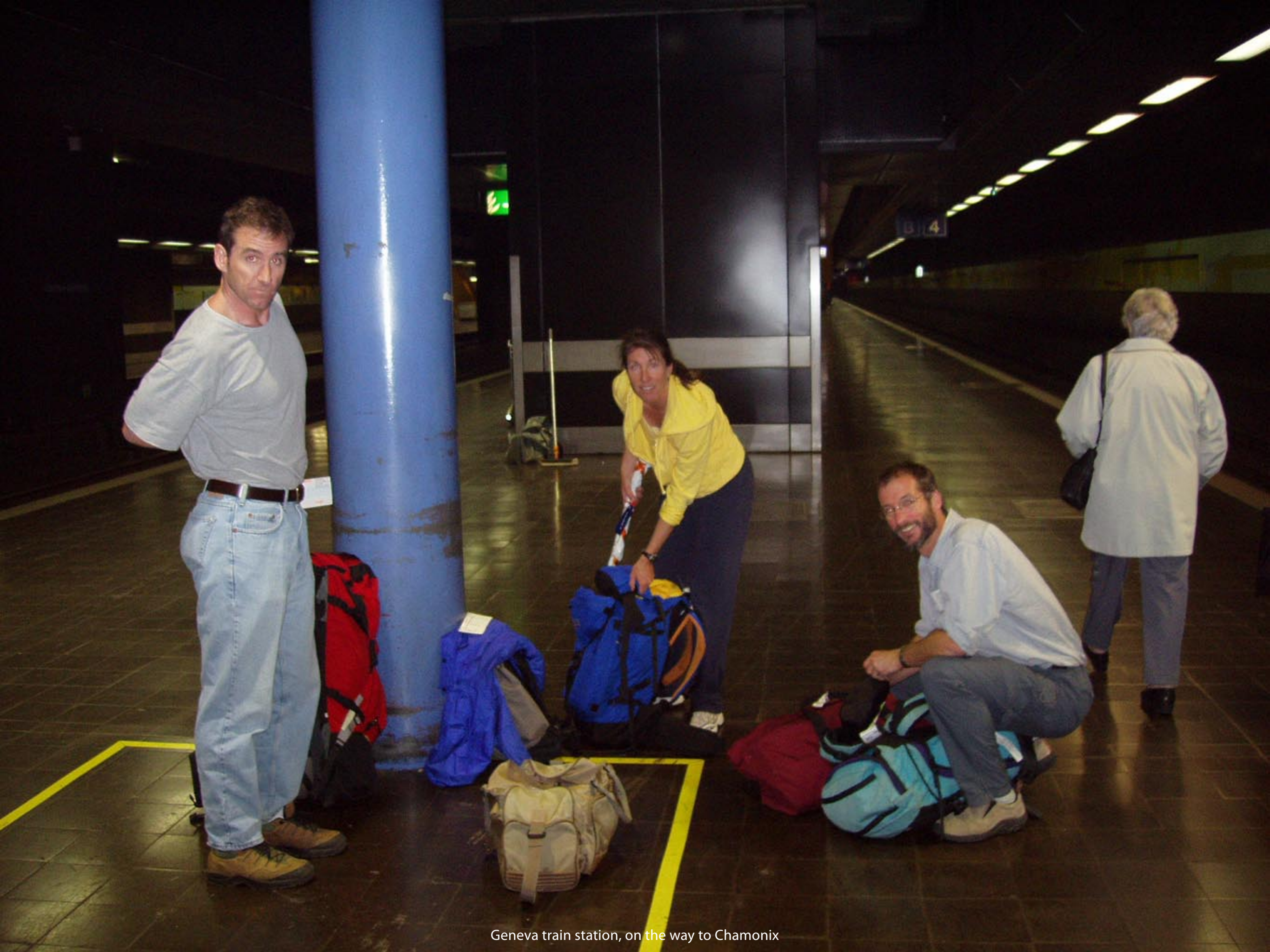
Geneva train station, on the way to Chamonix