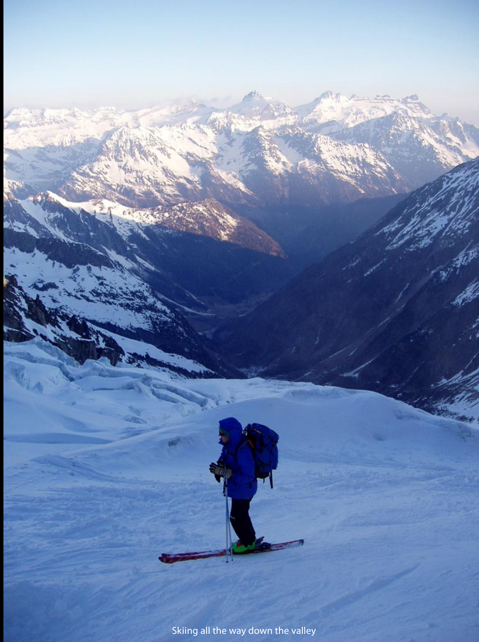
Skiing all the way down the valley