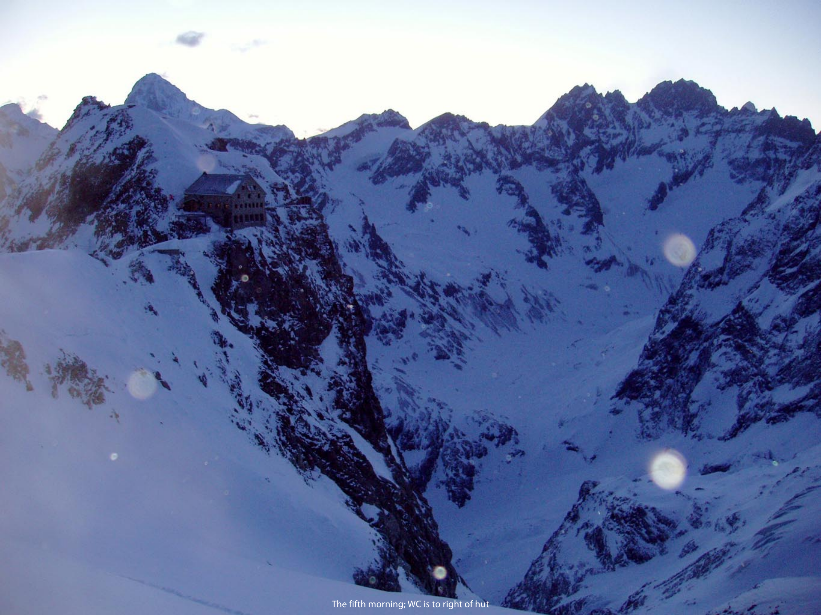
The fifth morning; WC is to right of hut