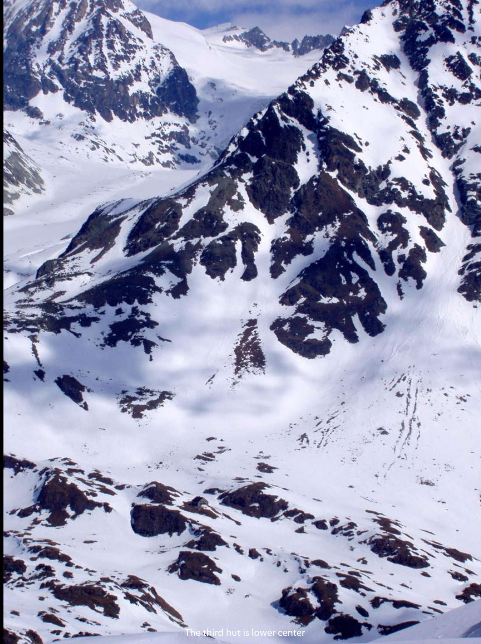
The third hut is lower center