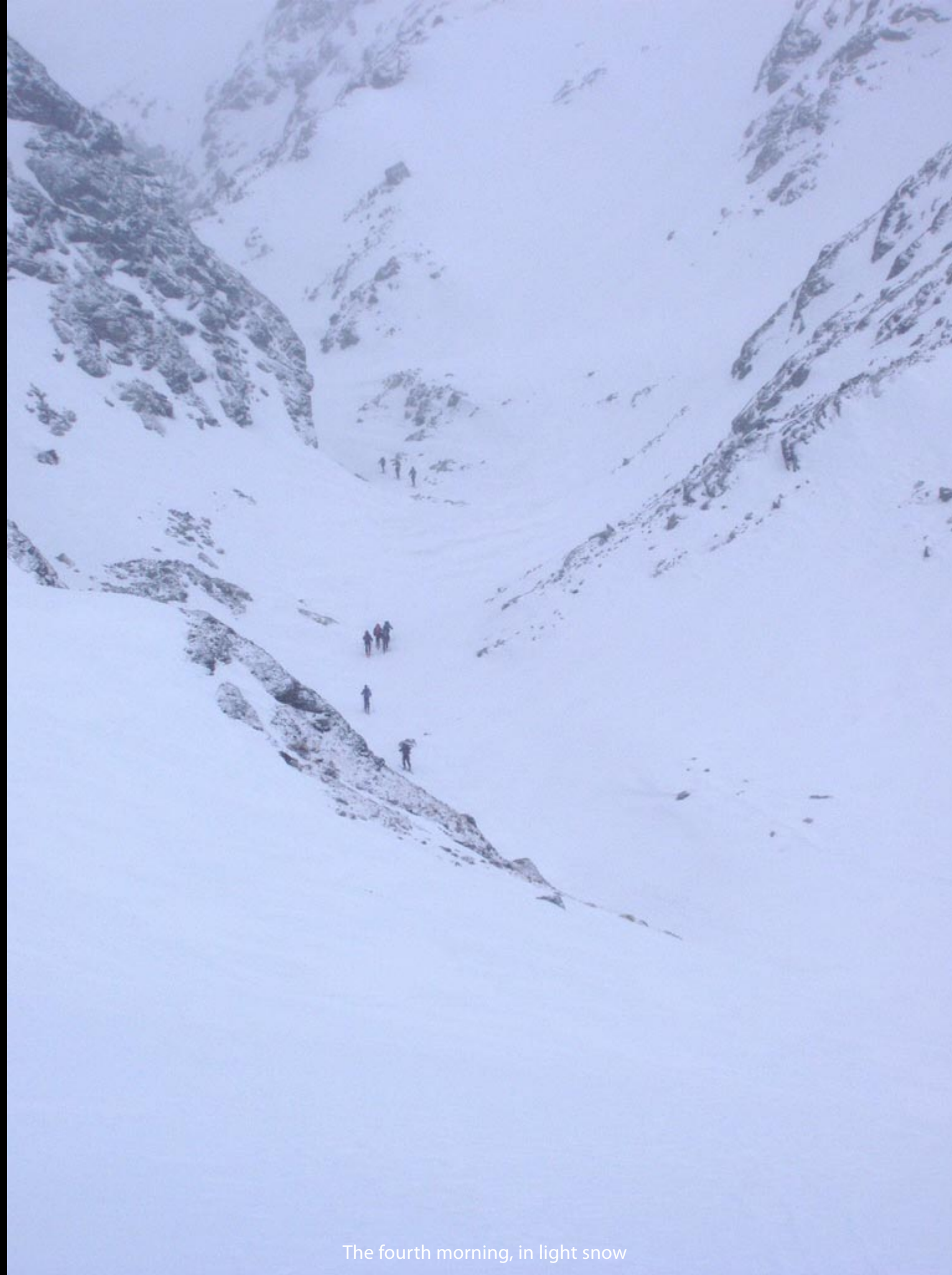
The fourth morning, in light snow