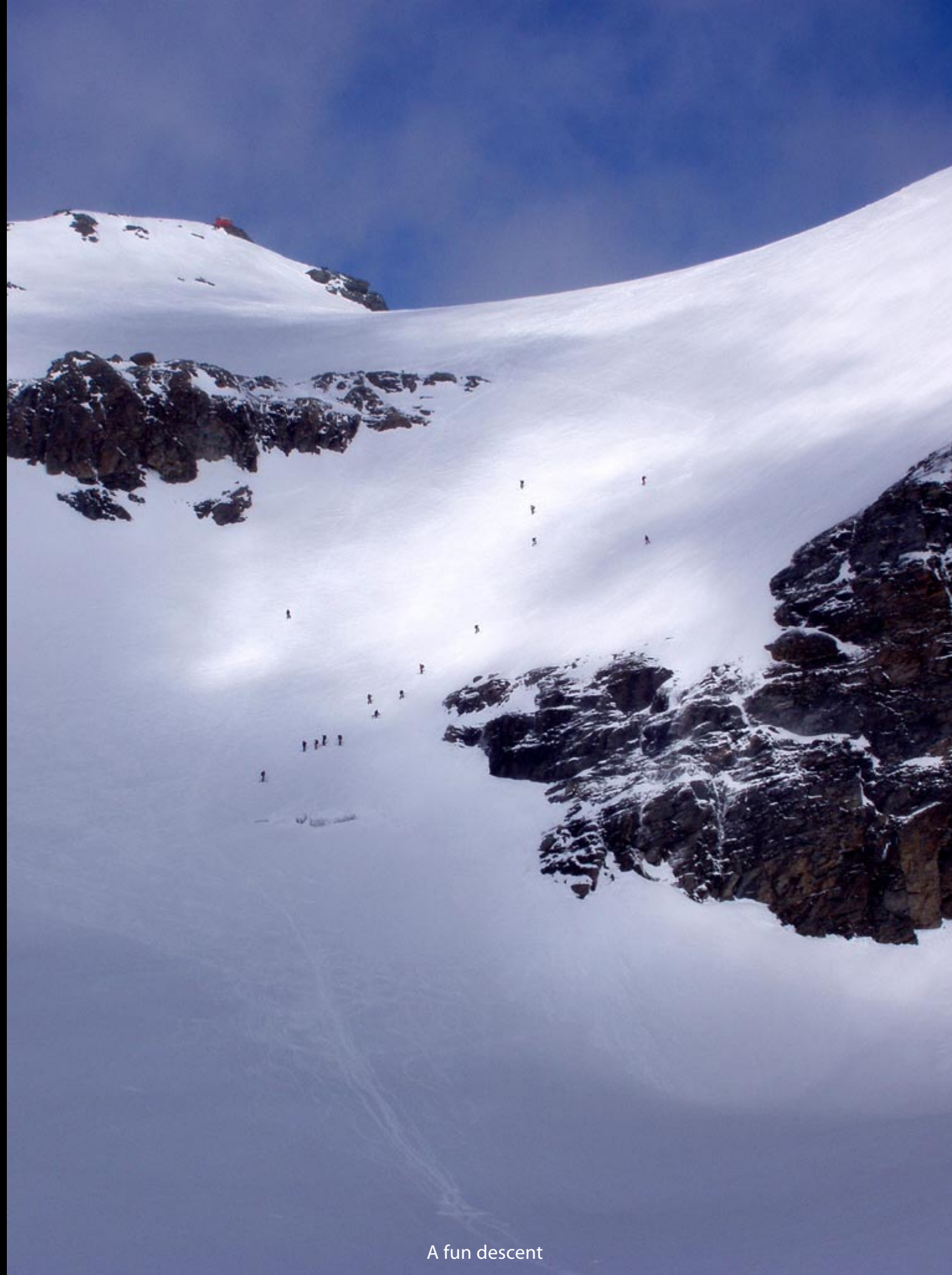
A fun descent