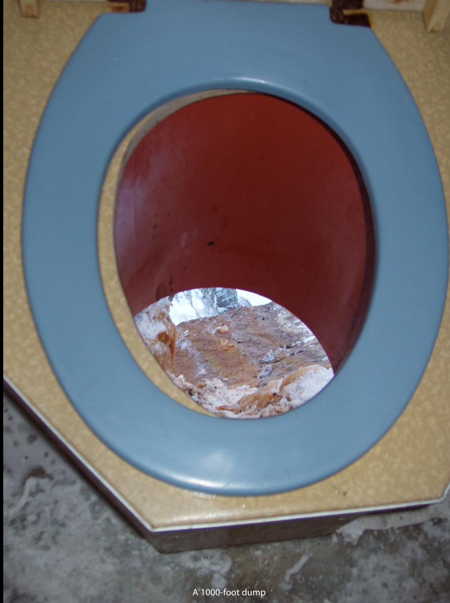
A 1000-foot dump