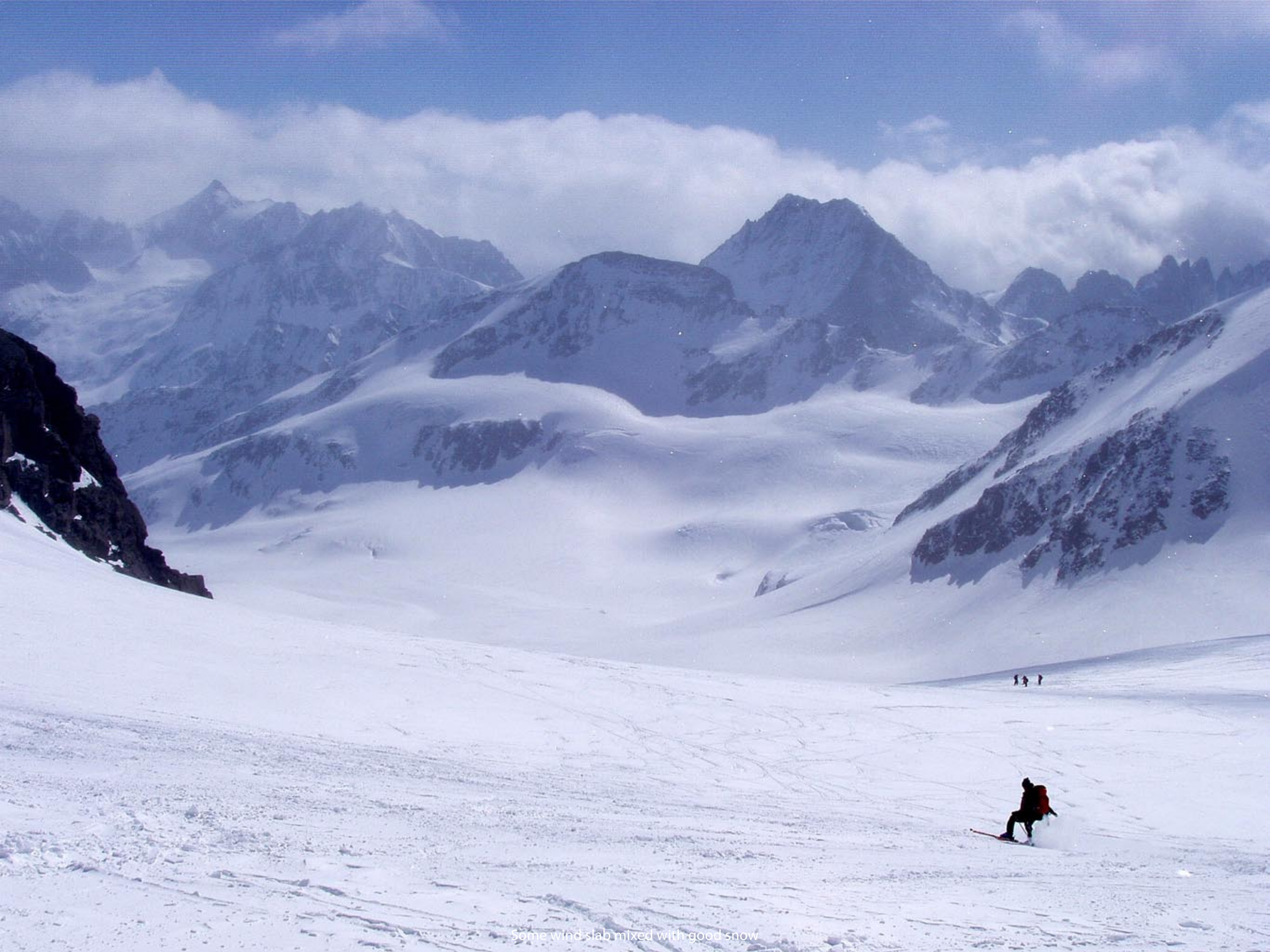
Some wind slab mixed with good snow