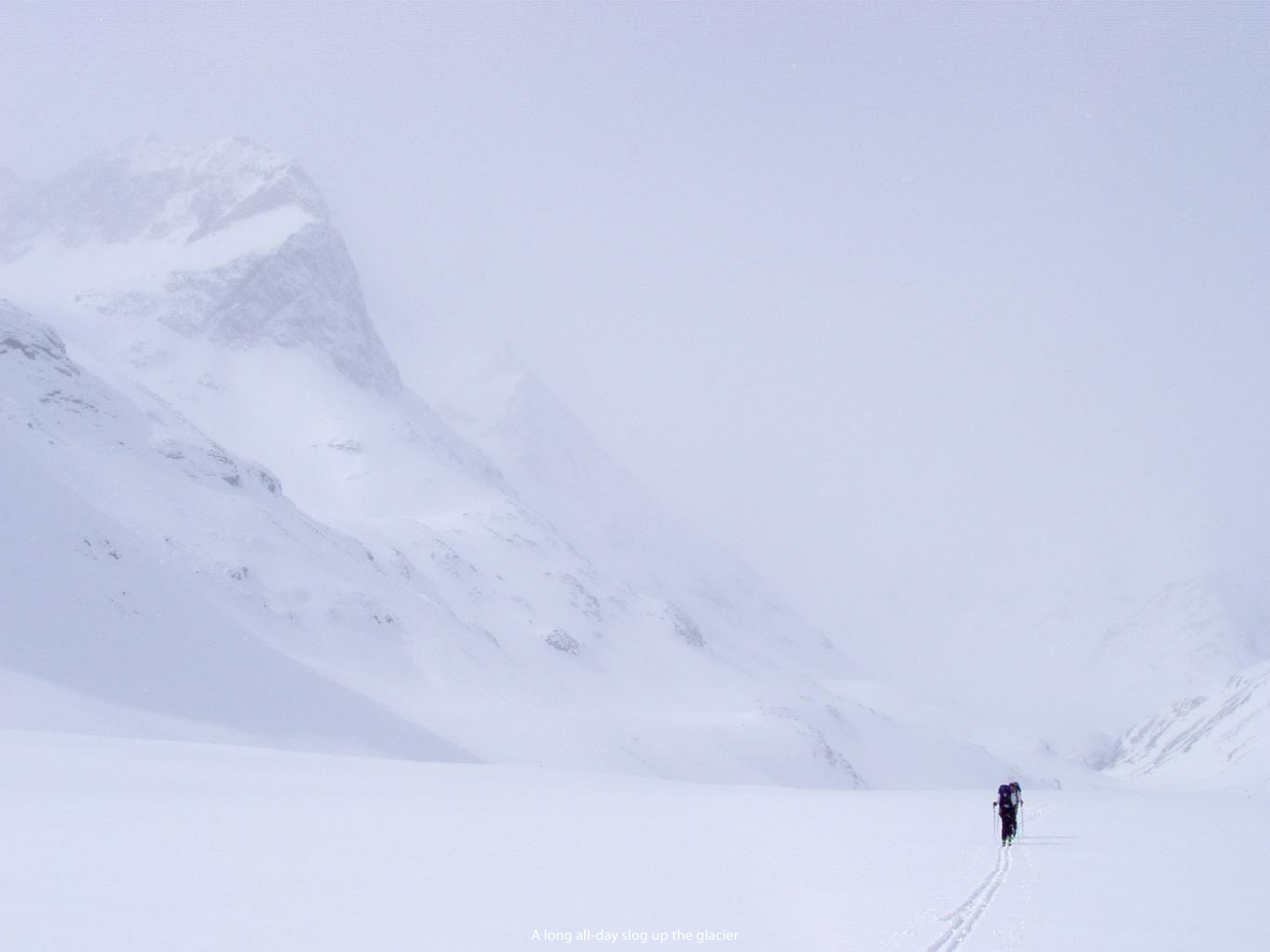
A long all-day slog up the glacier