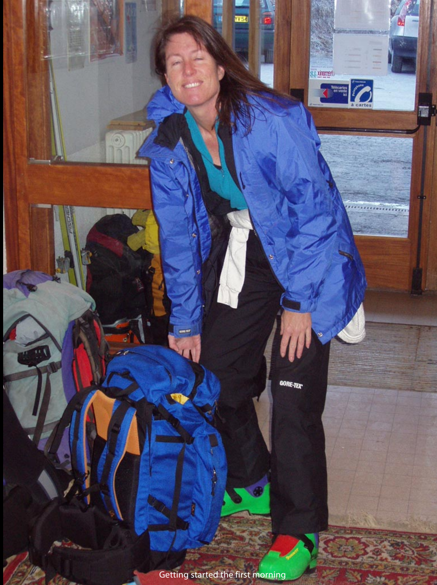
Getting started the first morning