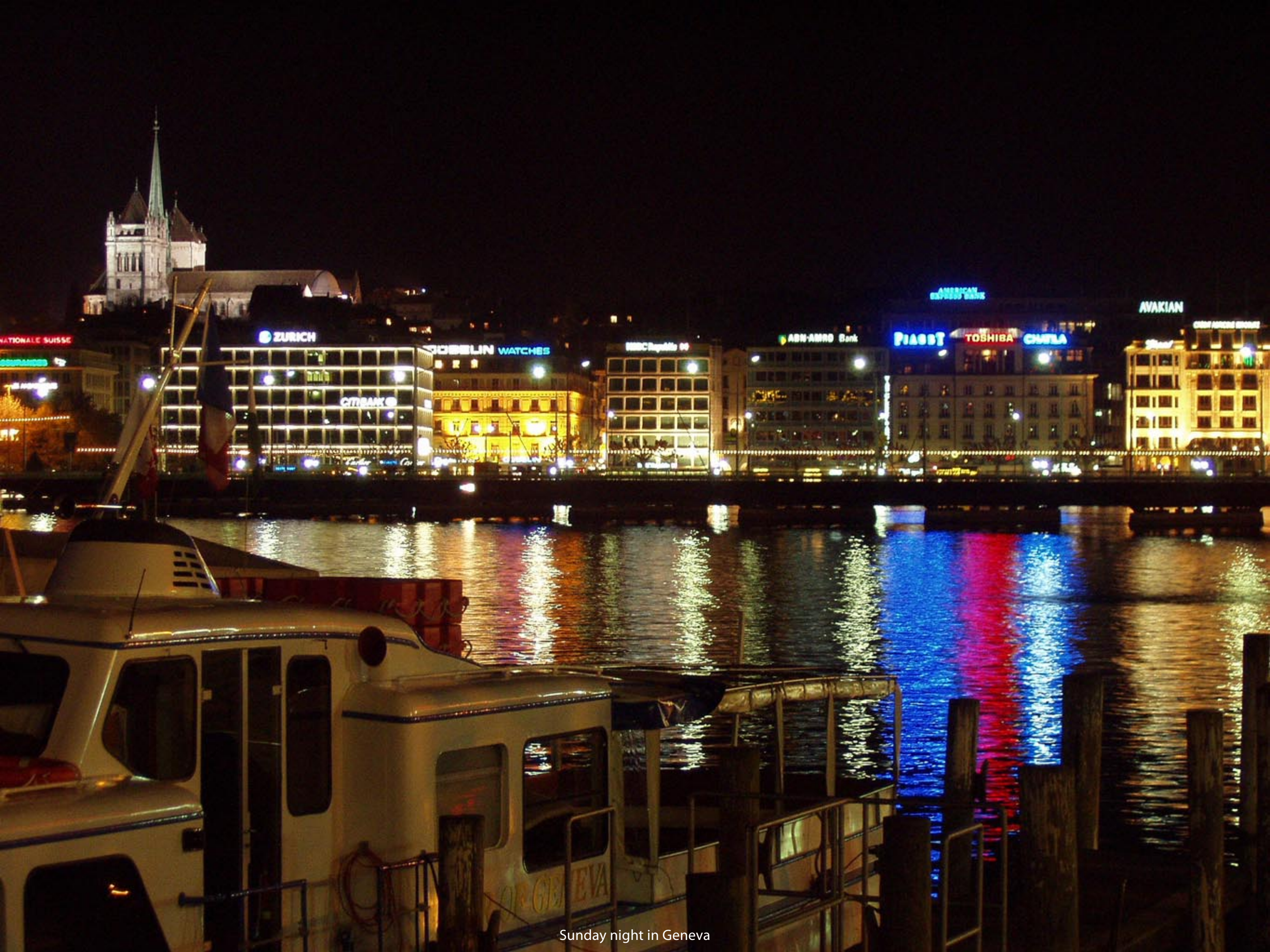
Sunday night in Geneva