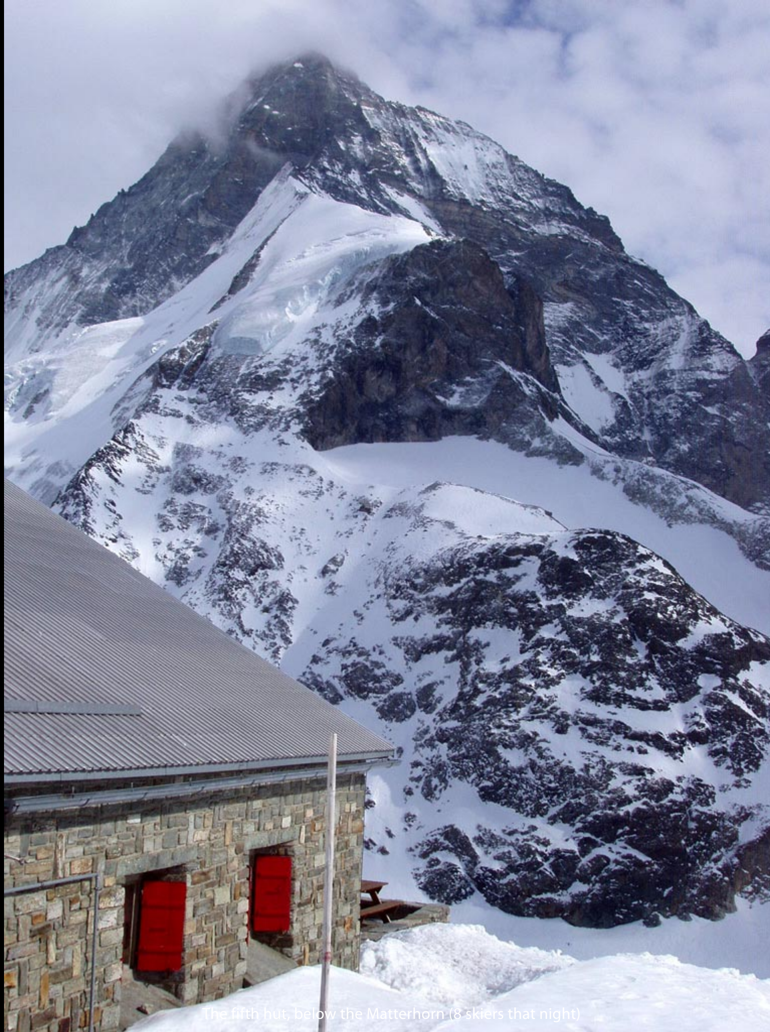
The fifth hut, below the Matterhorn (8 skiers that night)