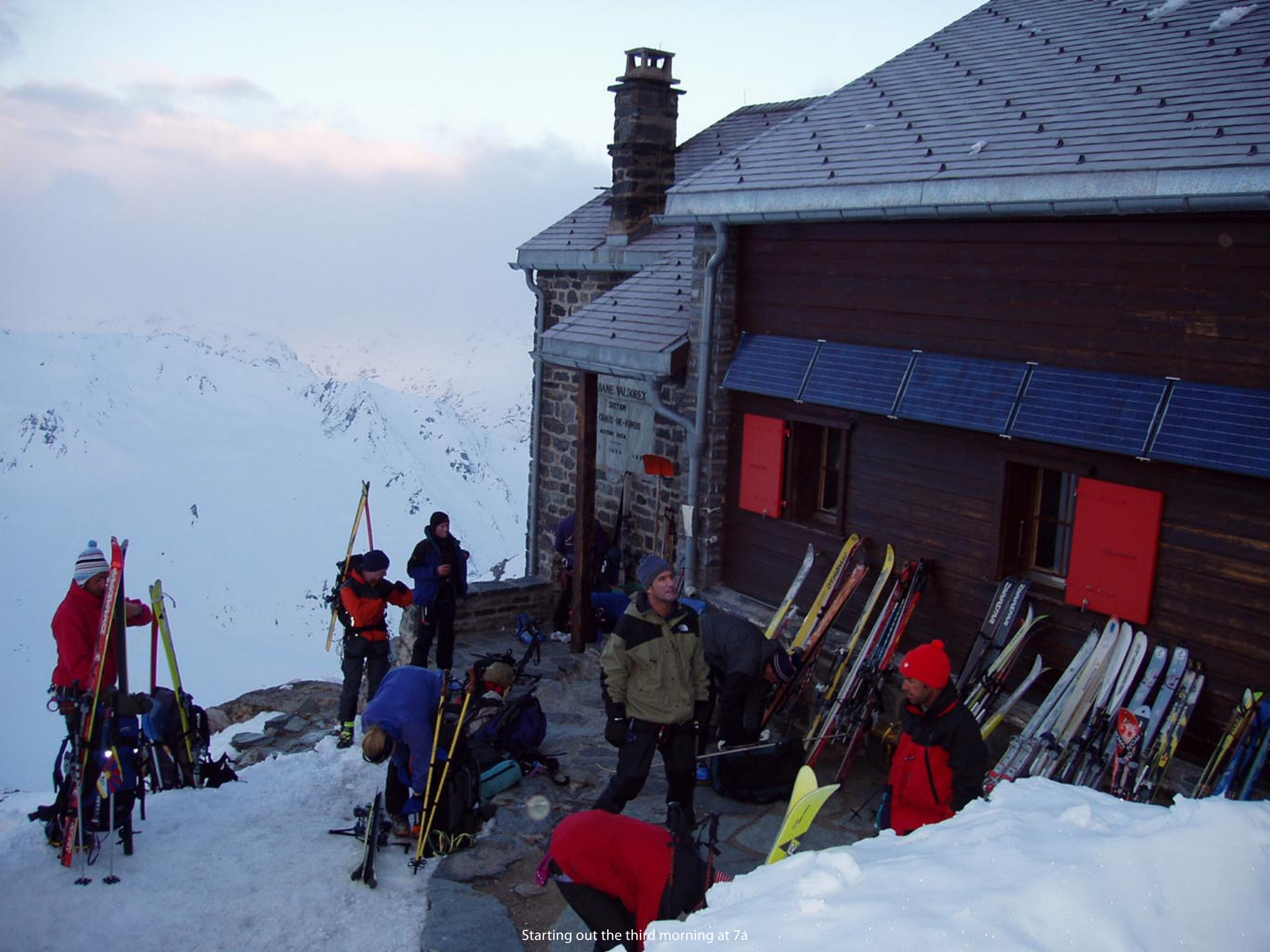
Starting out the third morning at 7a