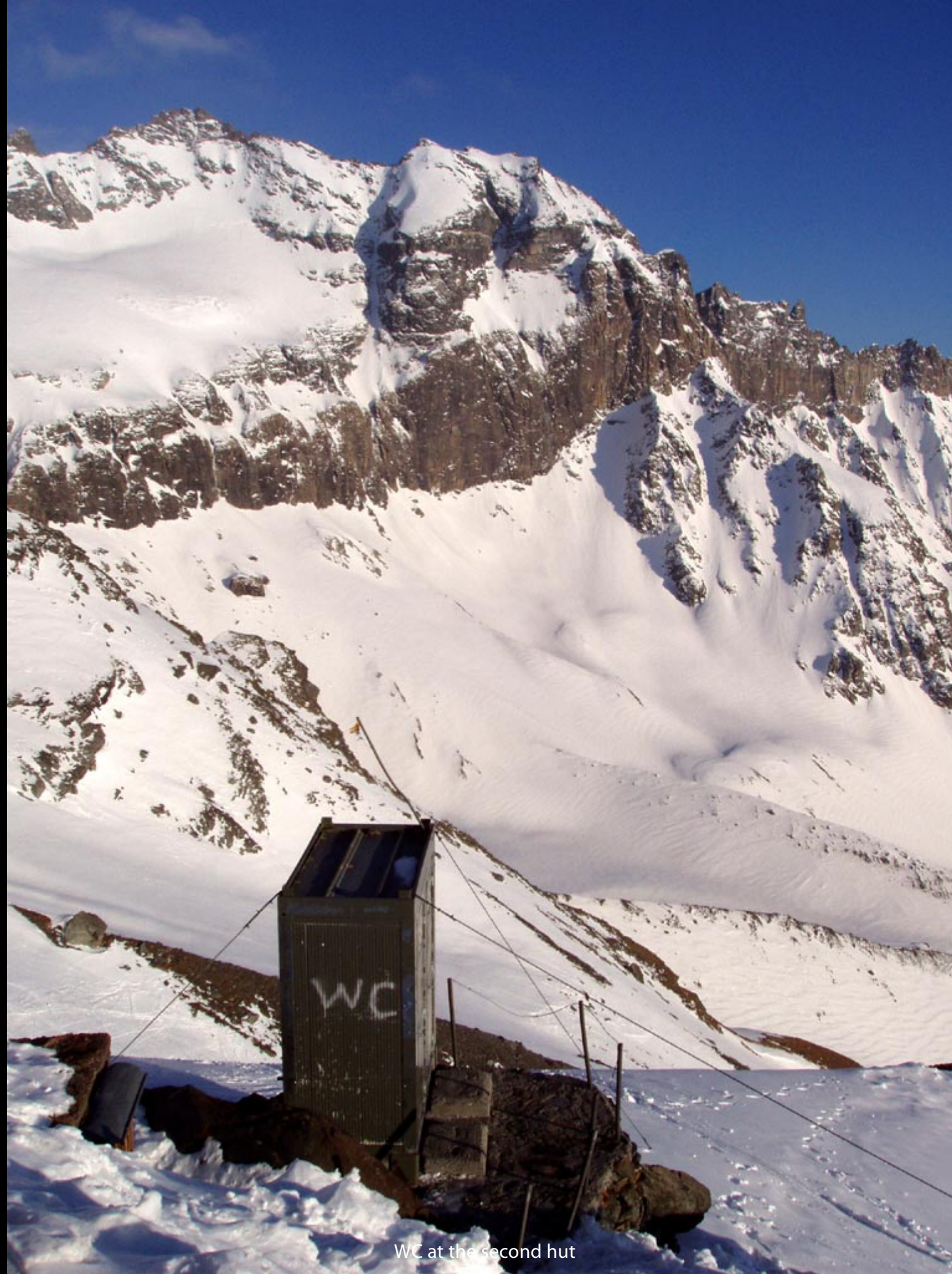
WC at the second hut