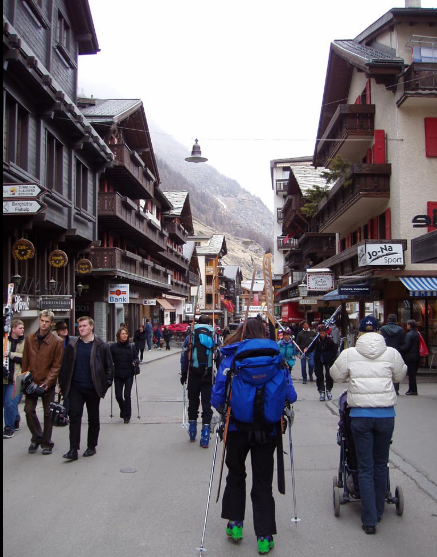
Fur coats and grubby skiers in Zermatt